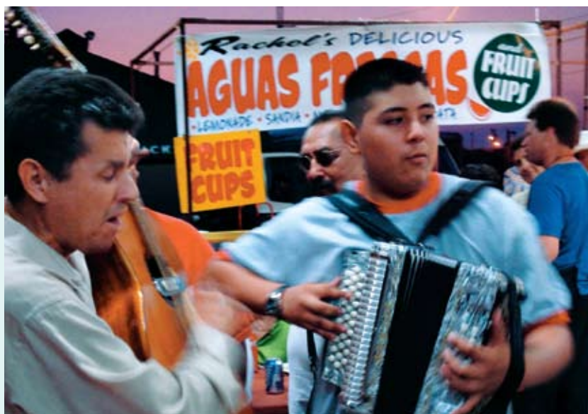
Figure 1 Father and son jam with bajo sexto and accordion at the Tejano Conjunto Festival en San Antonio , May, 2007.

Traditionally, Conjunto musicians learned to play the music at a young age from their families or from accomplished musicians in their communities. Historically there have been no formal institutions or structures in place to teach the music, and certainly no written materials. The Mexican-American communities in the Rio Grande Valley were in fact often migrant workers in the early years of Conjunto, and the