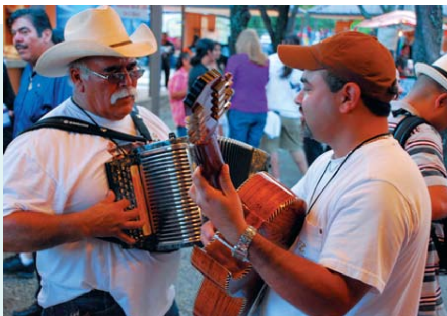
Figure 3 Two musicians informally jamming at the Tejano Conjunto Festival en San Antonio, May, 2010.