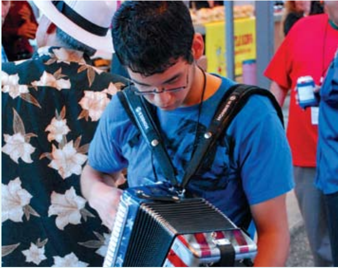
Figure 2 Boy trying out a new accordion at the Tejano Conjunto Festival en San Antonio, May, 2010.

institutionalisation of life and culture there was slow to develop. As a result, the tradition was handcrafted, localised, and idiosyncratic. Recorded music came largely from newly emerging regional record labels in South Texas such as Ideal , Del Valle Records , and Hacienda Records , and from small radio stations in the region. Today a major source for traditional recordings of the music is Arhoolie Records . The Arhoolie Foundation created the Strachwitz Frontera Collection of Mexican and Mexican American Recordings, an online digital archive of recordings and information hosted by the UCLA Chicano Studies Research Center. 4 The music, instruments, and other artifacts are housed and honoured at the Texas Conjunto Music Hall of Fame and Museum and at the Narciso Martinez Cultural Arts Center in San Benito.