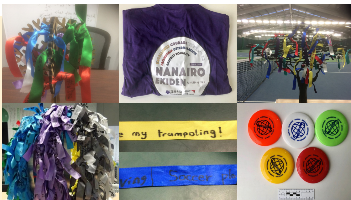
Figure 2 Material culture of the Nanairo Ekiden. Top L-R: Tree of Nanairo (Uruguay); purple participant shirt from Doha 2019 associated with the value of 'courage'; Tree of Nanairo (U.K.). Bottom L-R: Original Tree of Nanairo; ribbons expressing future sport goals (U.K.); mini frisbees with inscribed values (Japan).

The material culture of the Nanairo discussed in relation to intangible heritage in this paper is represented by three categories: (a) the trees of Nanairo; (b) ribbons attached to the trees; and (c) miscellaneous objects. Figure 2 shows some of the material culture of the event. All the objects are associated with the Olympic and Paralympic values and their identifying colours, as described above. For 'equality', the T-shirts were prepared and printed on black; however, the ribbons to be associated with the Tree of Nanairo were grey – so that the writing could be seen clearly.