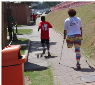
Rio de Janeiro, Brazil