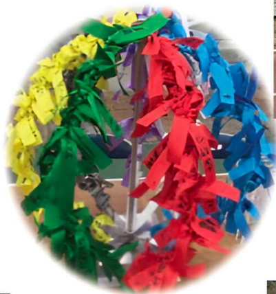
Tree of Nanairo